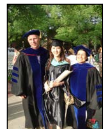
MA TESOL Graduation, NV.

During the two years in the master's in TESOL program, I learned methodologies, approaches, and theories that have changed my views of teaching. I strike a balance between teacher-centered instruction and student-centered instruction to help students achieve communicative competence. I also understand that student populations differ; therefore, we as teachers must accommodate the needs of the students and be open to new teaching methods.