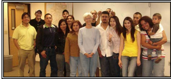
My students at Truckee Meadows Community College, NV, USA

I also learned a lot of hands-on experience through my jobs in Reno. In the daytime, I worked at the Intensive English Language Center as the director's assistant. In the evenings, I was an ESL instructor at the Truckee Meadows Community College Adult Basic Education Program. I planned lessons and taught English as a