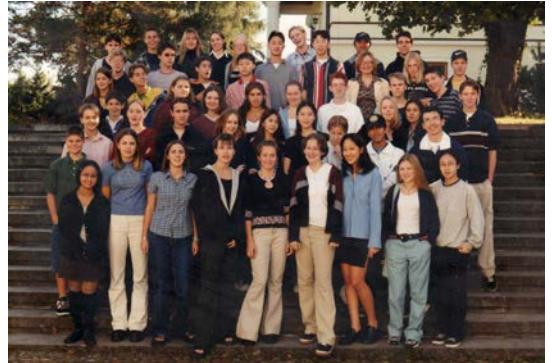
American School of Warsaw, Poland

I was born in Taiwan, and both my parents are Taiwanese, but due to my father's occupation as a professional diplomat, I had the opportunity to travel and live around the world as a child. I have lived in Uruguay, Panama, The United States - New York, Reno, Poland, Taiwan, Honduras, and Malaysia (averaging about 2 years per country). Although it was hard getting used to the drastic changes caused by moving every 2 to 3 years, I had the chance to experience different cultures, people, religions, weathers, and languages. These experiences built up my ability to adapt to different cultures and most importantly my native-like language skills in four languages, English, Spanish, Chinese, and Taiwanese. During my stay in some countries, I studied in local schools, but mostly in American schools where English was the main language of instruction. I grew up with racially diverse groups from around the world.